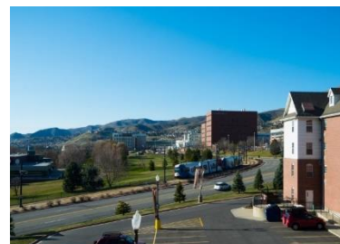
Mountains and train from the campus